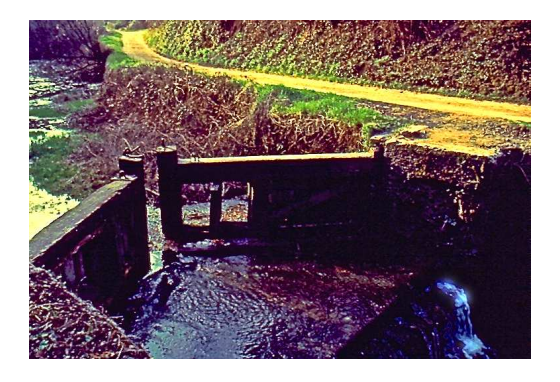
Naviglio di Paderno