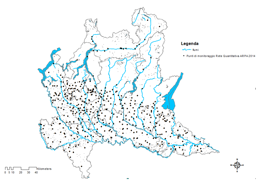
Regional network of quantitative monitoring