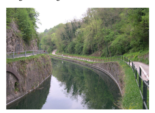
Naviglio di Paderno