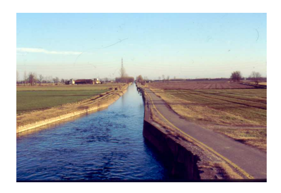
Naviglio di Bereguardo