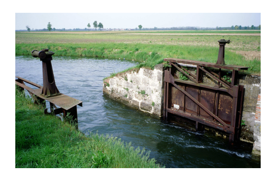
Naviglio di Bereguardo