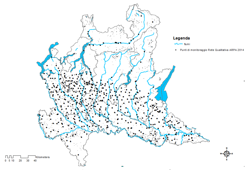
Regional network of quality monitoring

The regional network includes 521 points for the qualitative monitoring and 447 points for quantitative monitoring; on some points ARPA – Lombardia has carried out both types of monitoring. The first operational monitoring cycle was started by ARPA Lombardia in 2009 and ended in 2011. The second three-year cycle began in 2012 and was terminated in 2014, the year in which the first six-year cycle for the monitoring of supervision is completed