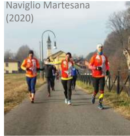
Naviglio Martesana (2020)