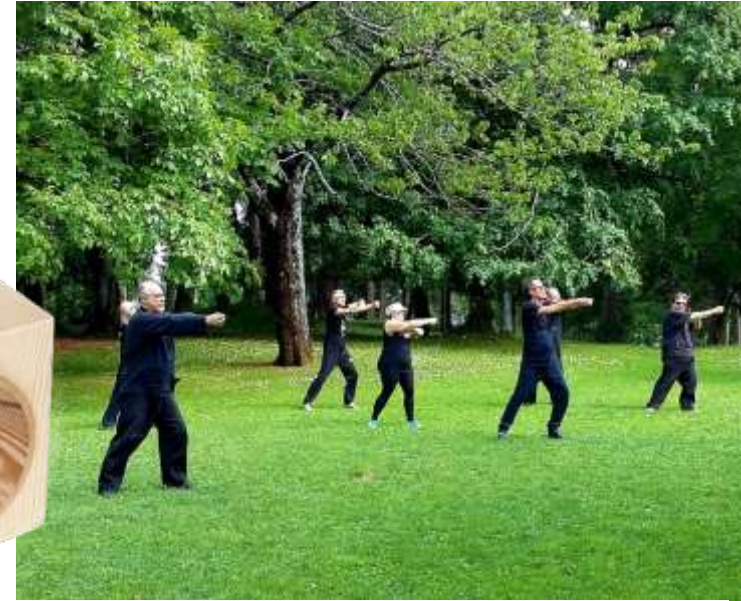
Compass - Martesana - Alla scoperta dell'antica arte del Tai Chi nei parchi della Martesana

Carugate | Cernusco Sul Naviglio | Martesana | Melzo | Sport