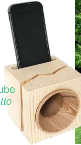
VAIA Cube imperfetto