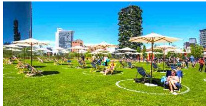
Lido BAM, Milano Porta Nuova, estate 2020